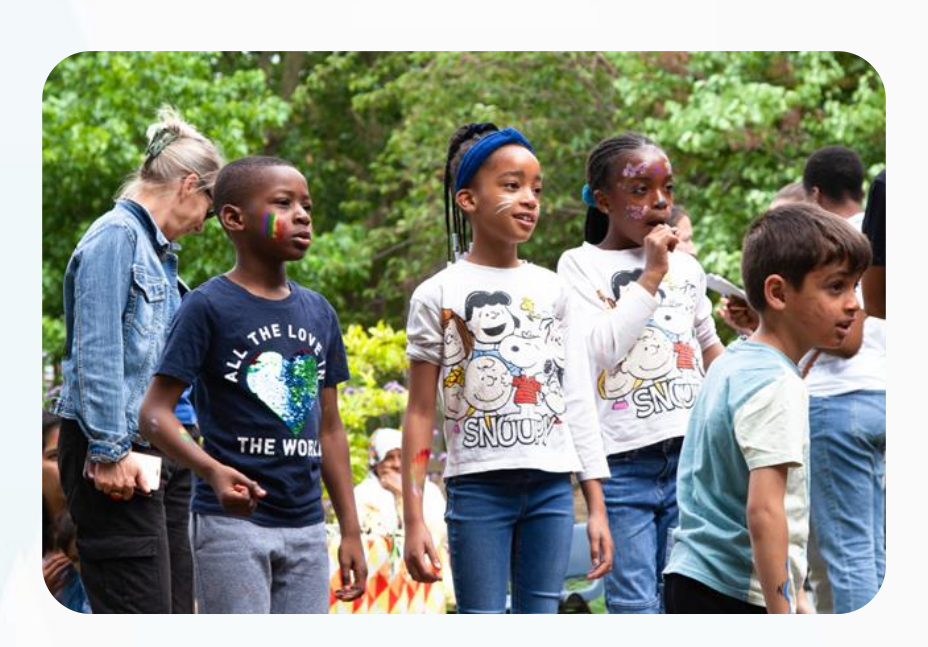
A family event