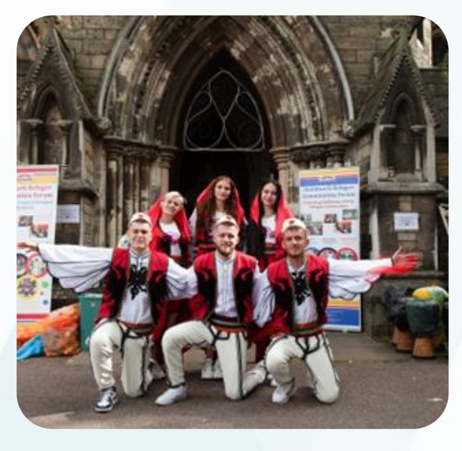
Ardhmeria (Albanian) group