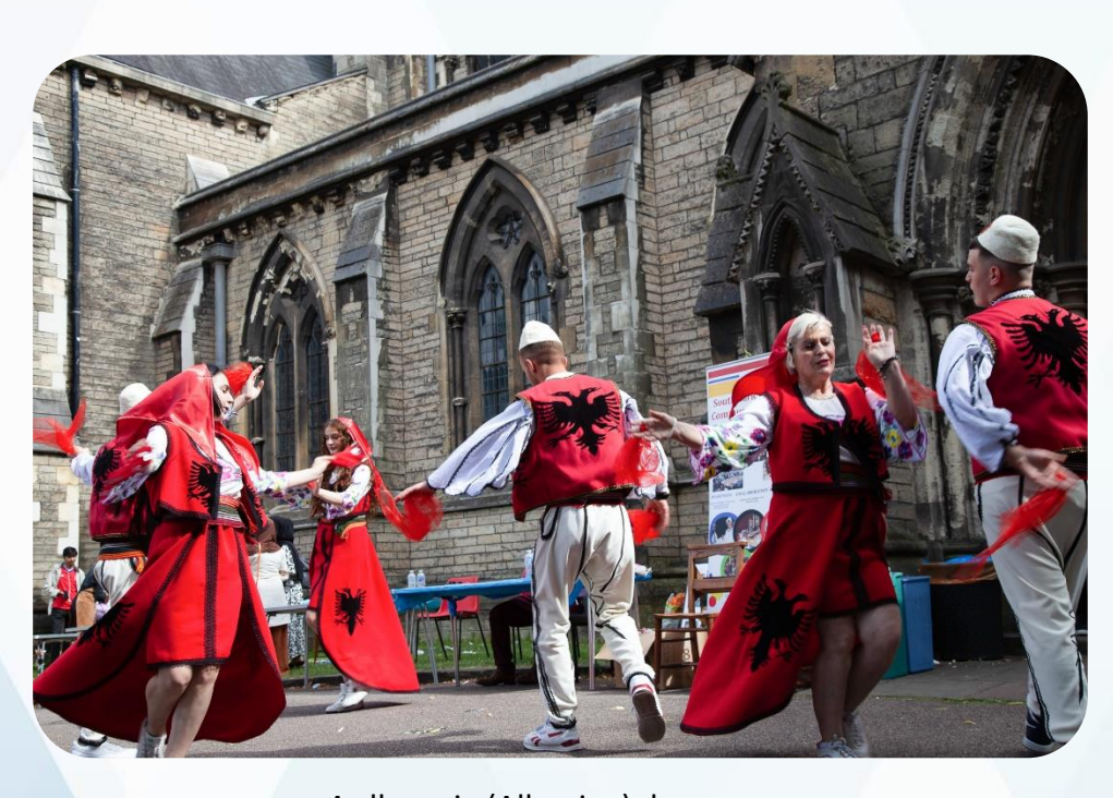
Ardhmeria (Albanian) dance group