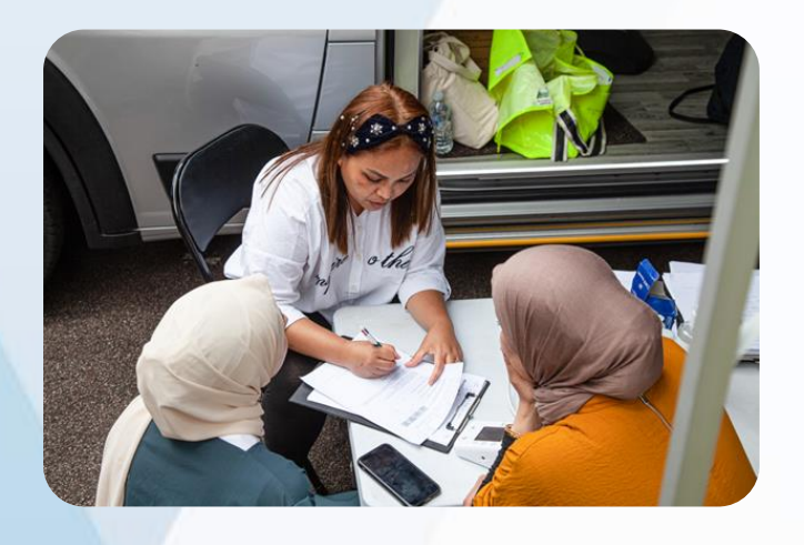
Advice & Information

We were grateful for the presence of Southwark Refugee & Migrant Project.