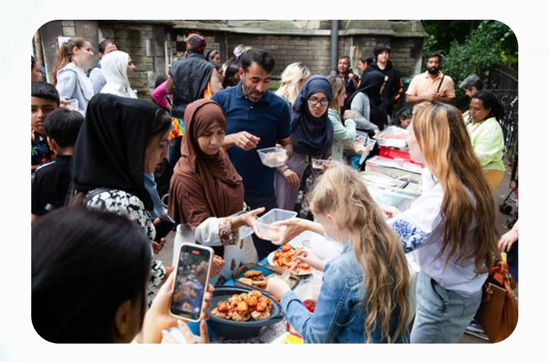
Traditional food was prepared by the Syrian, Ukrainian and Ethiopian communities

A plethora of organisations in Southwark joined us on the day to provide services to members of the Refugee community: